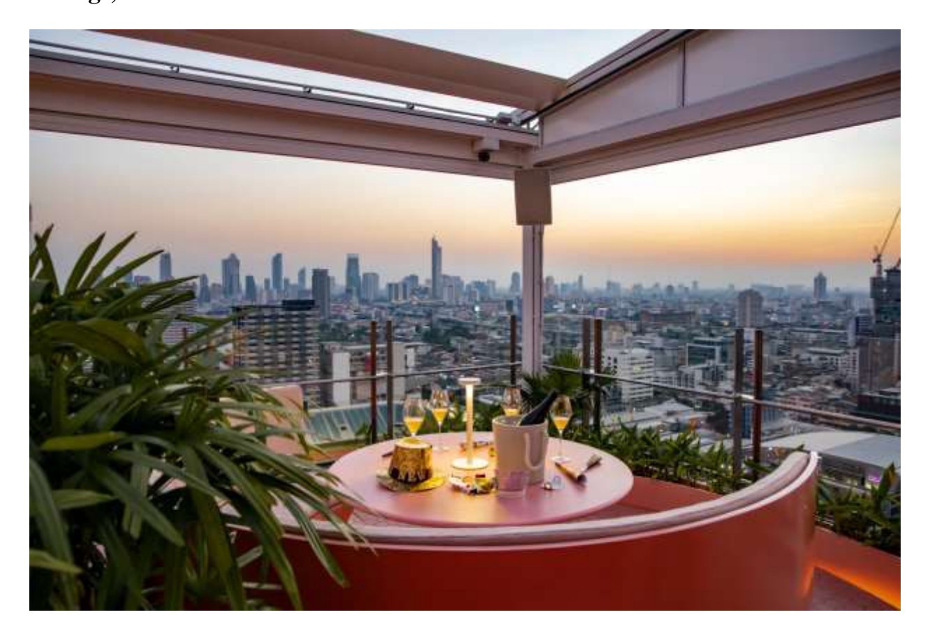
By Laurel Tuohy

Looking for a new perspective... literally? These rooftop bars offer sublime settings, views and vibes.